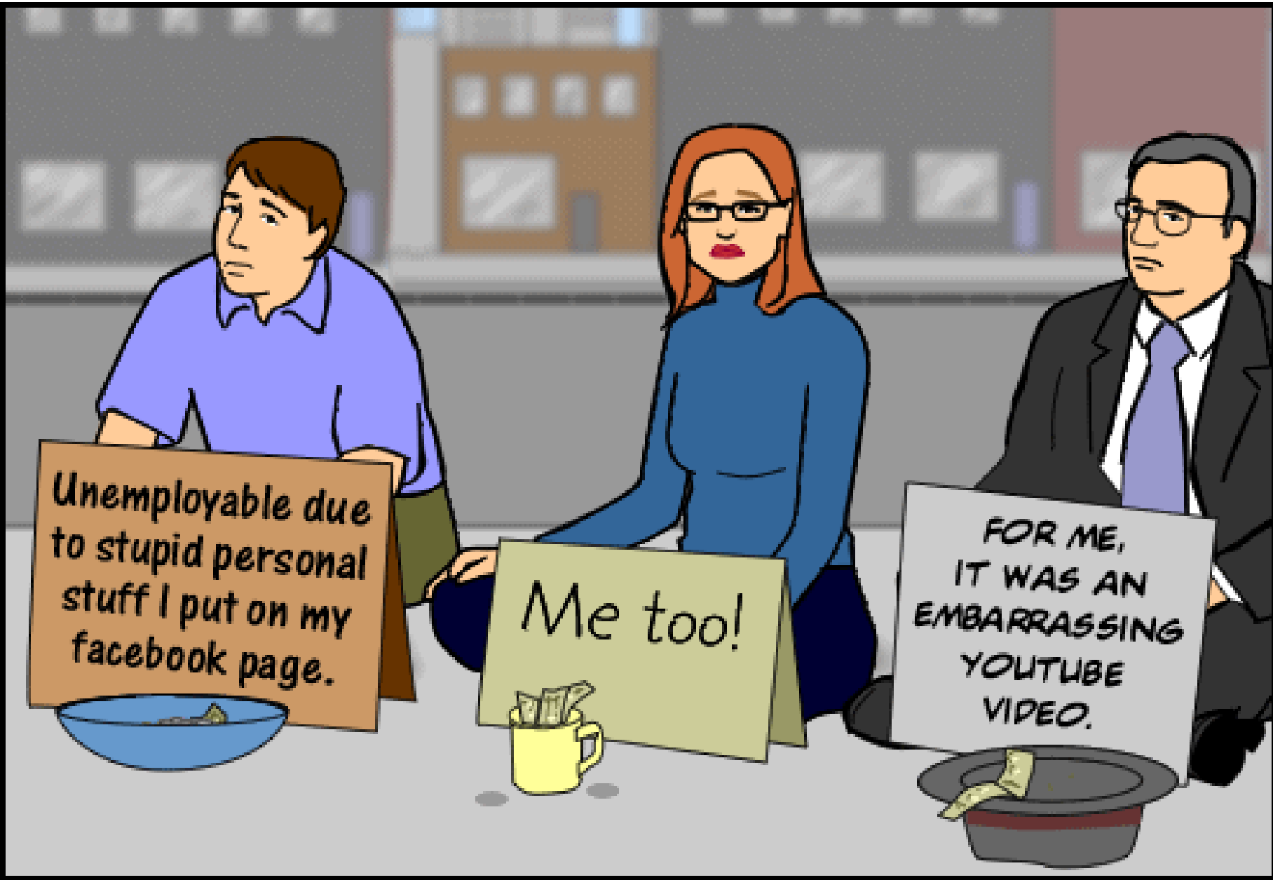
Signs of the social networking times.